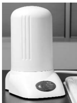
Model Nos: MPADC